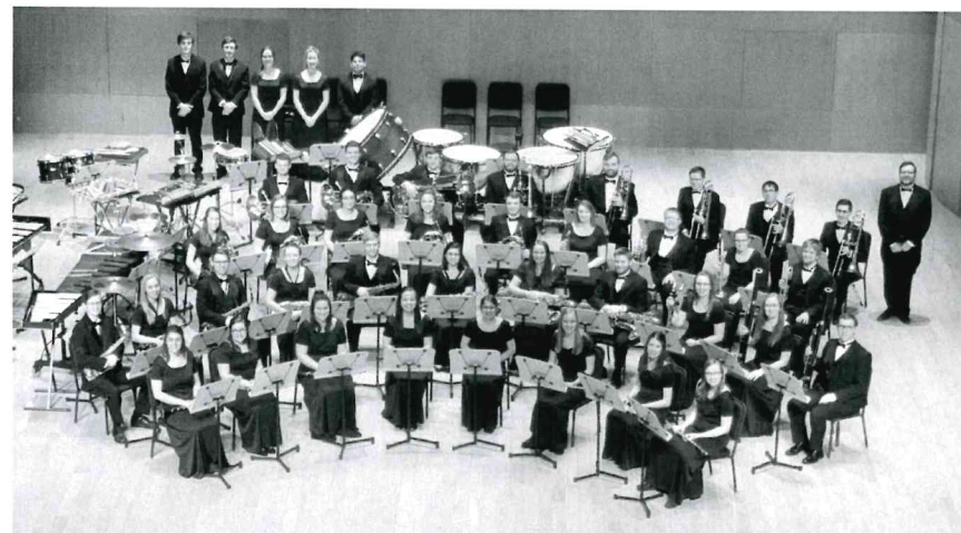
The Augustana Band ready to perform at the National Library of China Concert Hall, Beijing.

During the January Term, the Augustana Band cruised the Yangtze River and voyaged through historic Wuhan, Xian, Beijing and Shanghai on a guided journey fit for ancient emperors and eager Augustana Vikings.